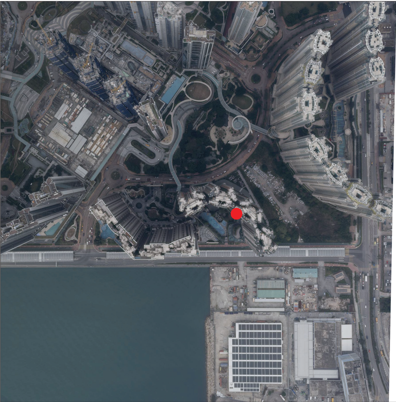
Location of the Phase 期數的位置

This blank area falls outside the coverage of the relevant Aerial Photograph 鳥瞰照片並不覆蓋本空白範圍